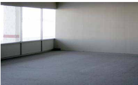
Before: Originally designed for retail purposes, each suite has an open floor plan awaiting your custom design