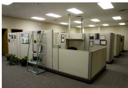
After: ACC Electronix' administrative workspace boasts all the features of a new build-out at a fraction of leasing costs